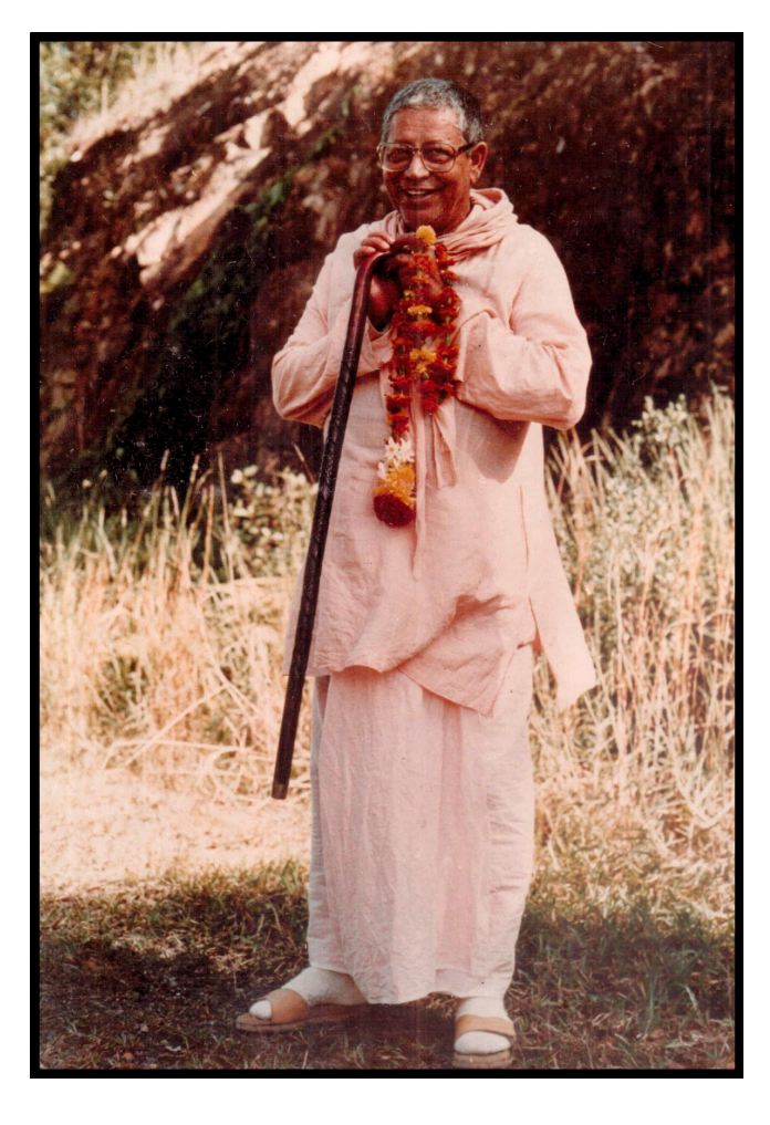
THE EMBODIMENT OF LOVE & AFFECTION